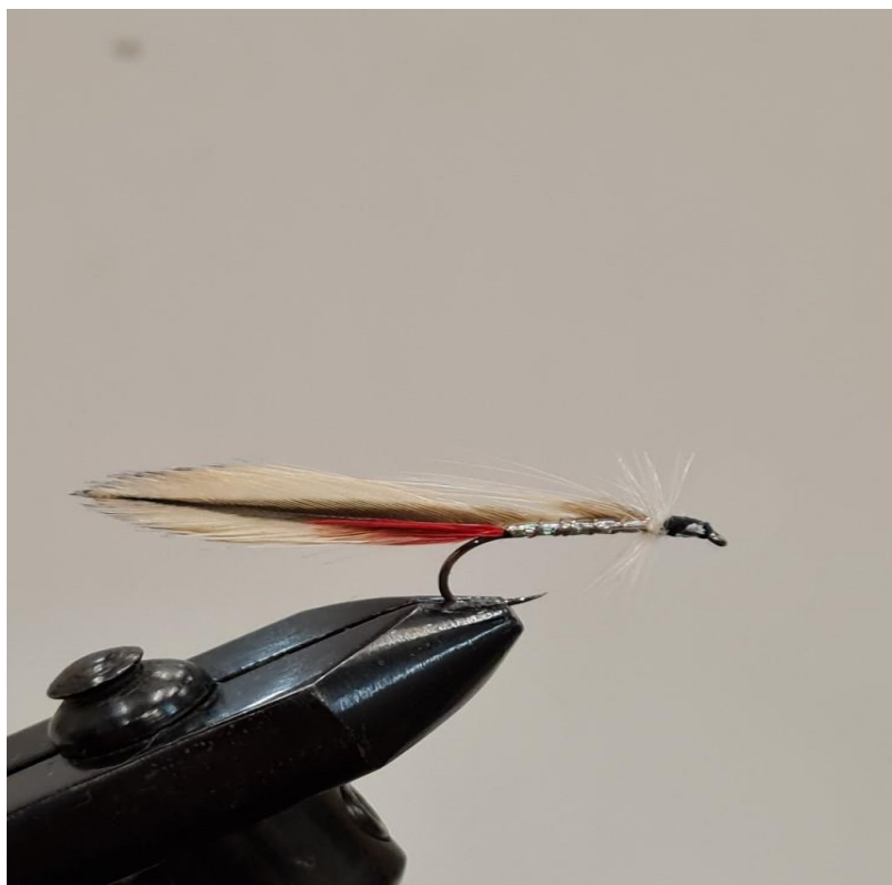
Jack Sprat Fly