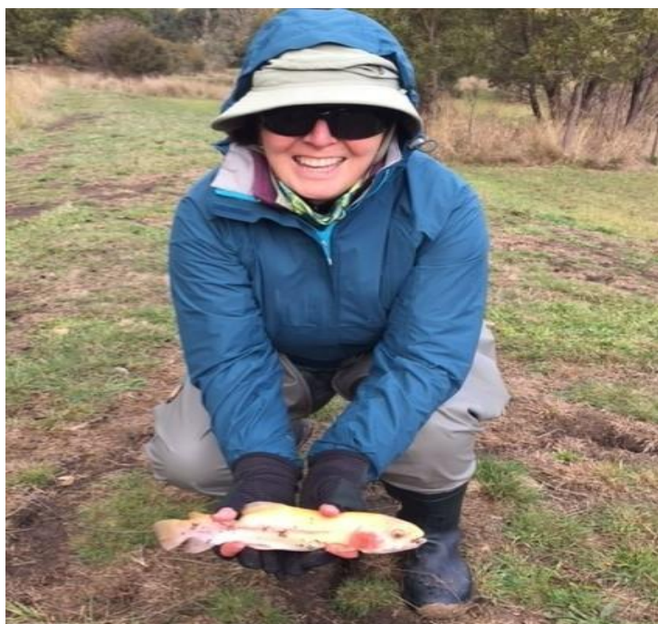
Merril's Golden Trout