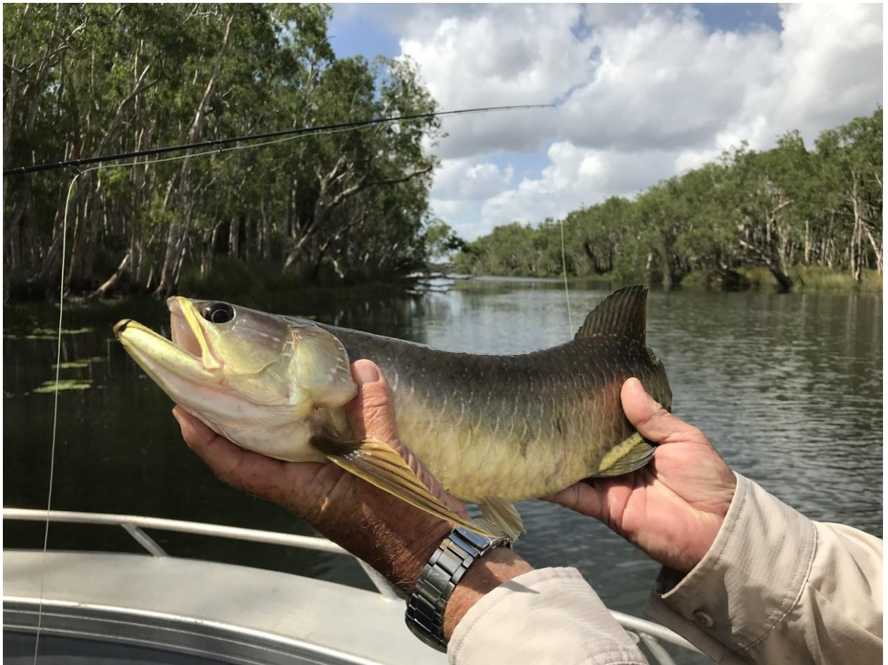
George's Saratoga Up Close