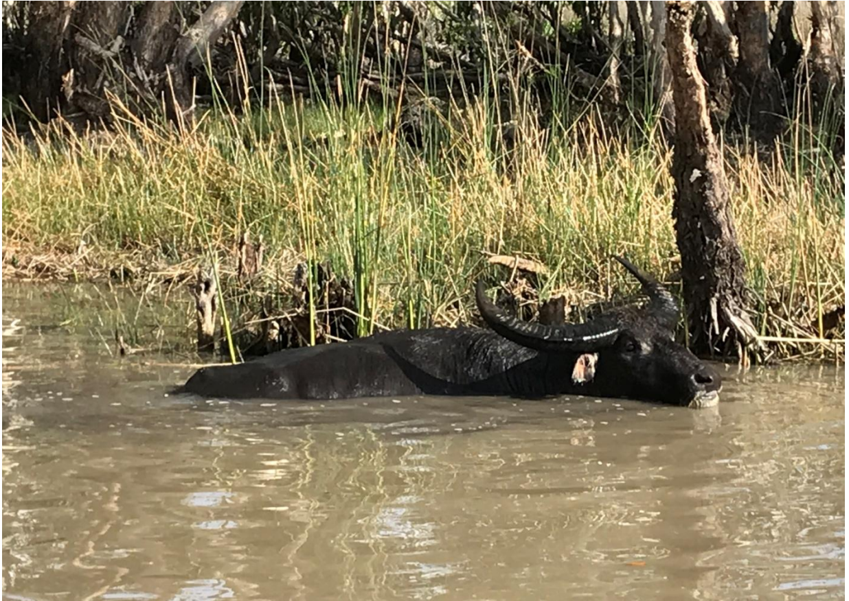
Neville The Buffalo