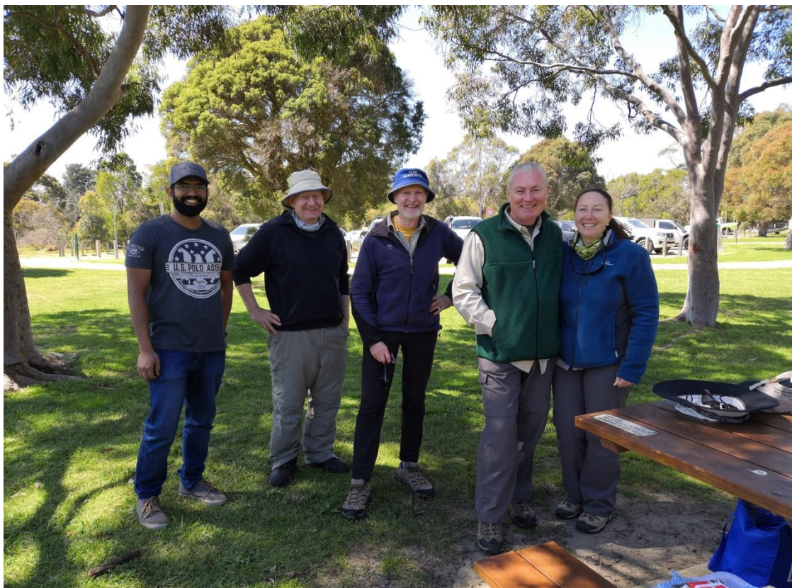
Devil Bend BBQ