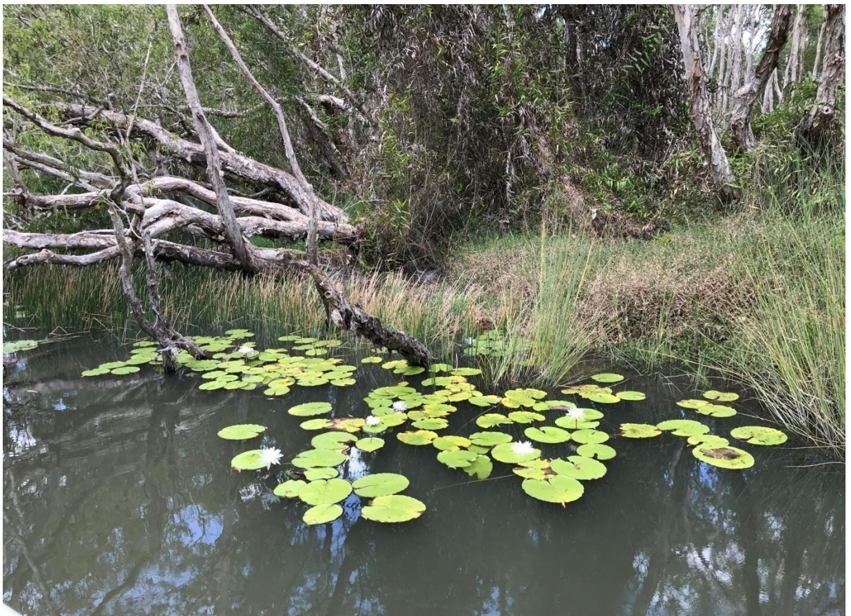
Goose Creek Lily Pads