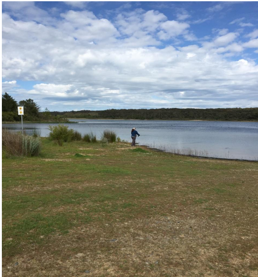
Merril Fishing Devil Bend